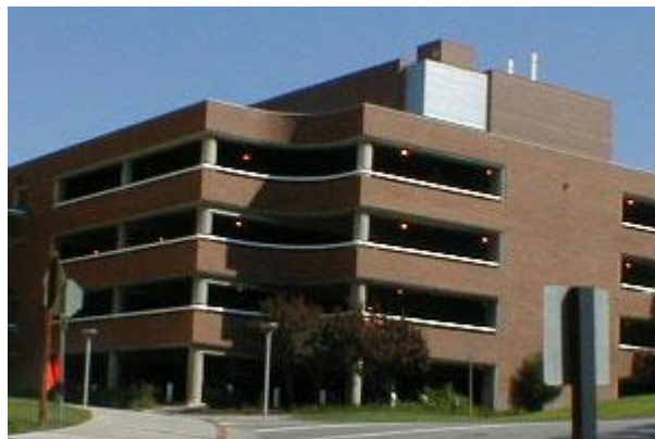
South Medical Garage

FIRST FLOOR PLAN HEALTH SCIENCES EDUCATION BUILDING UNIVERSITY OF UTAH